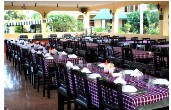
Springlands Hotel in Moshi - Delicious outdoor covered dining before and after the climb.