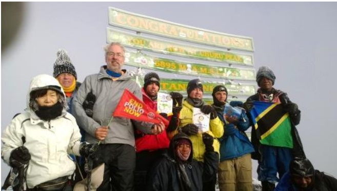
2013 Rotary climbers - All made it to the top at Uhuru Peak at 19,341 feet.